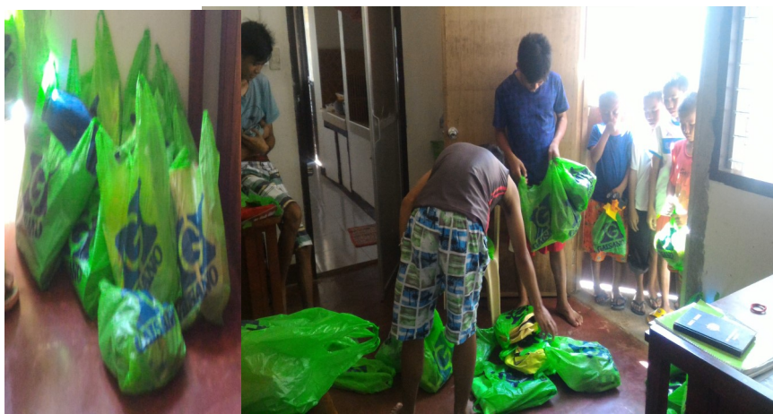
School supplies were distributed to the ACCC residents.